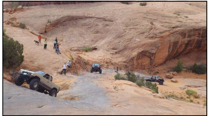
Poison Spider Mesa

In last month's newsletter we outlined some basic maintenance for your rig. This is a good way to start preparing your off road machine for the strains Moab can put on it. Sometimes the worst can happen and things do break while out on the trail. It is always a good idea to have spare parts on hand. What Parts do I need? In the unlikely hood that something breaks, which can