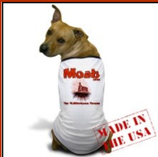
Well Behaved dogs are always welcome.