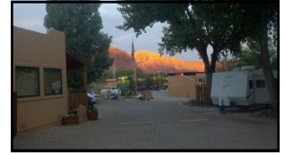
Canyonlands Campground: More info Click Here

away. Everything you'll need to have a rejuvenating stay in the beautiful red rock desert called Moab